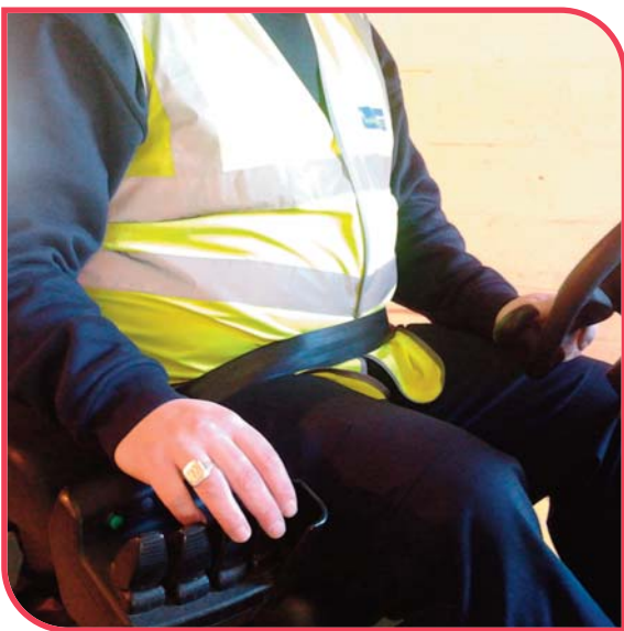
SEATBELTS MUST BE WORN

ONLY AUTHORISED PERSONNEL ARE PERMITTED TO OPERATE FORK LIFT TRUCKS • ALWAYS USE SAFETY WEAR PROVIDED • ALL PRE-USE CHECKS MUST BE CARRIED OUT AND DEFECTS REPORTED