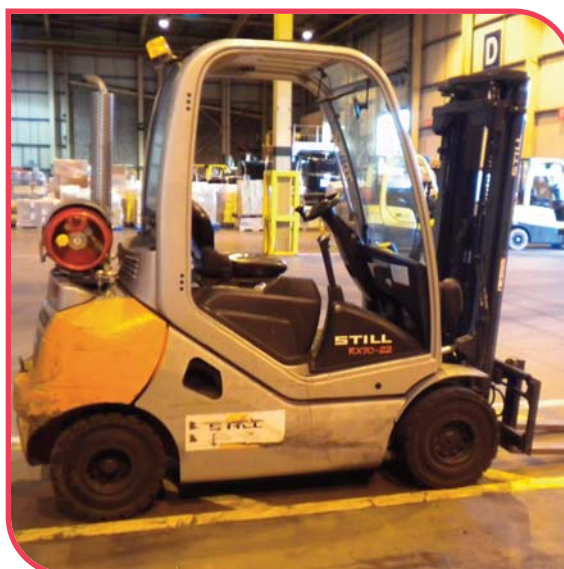
PARK IN THE DESIGNATED AREA