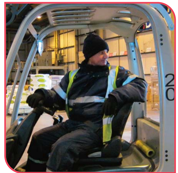
ALWAYS LOOK IN THE DIRECTION OF TRAVEL